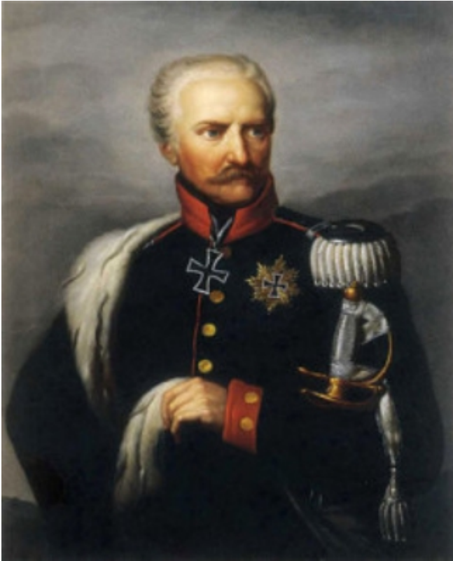
Prince Leberecht von Blücher

fall from power and his last days as the Commander and leader of the French.